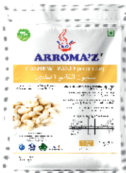
CASHEW PASTE (Regular)

PACKING: 01 Kg x 12 packs (Carton of 12 Kg)