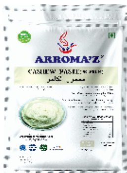
CASHEW PASTE (Premium)